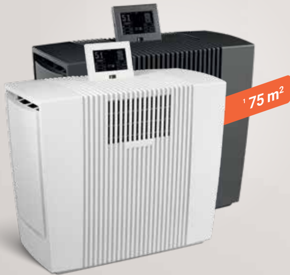
App Control Air Purifier LP60

1 Air purification for rooms up to 75 m 2 .