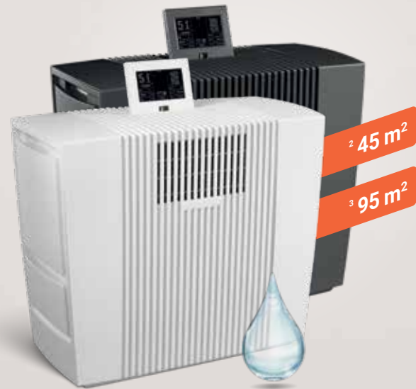
App Control Hybrid Air Purifier and humidifier LPH60

2 Air purification for rooms up to 45 m 2 .